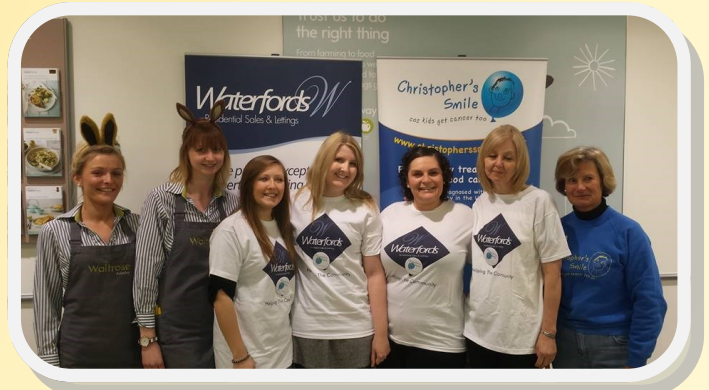
ABOVE: Waitrose partners and our Waterfords volunteers