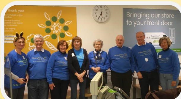
BELOW : Some of our fabulous Christopher's Smile volunteers at the end of a long day!

In the run up to Easter Christopher's Smile volunteers packed customer bags in Sainsbury's Camberley and Waitrose in Frimley . We had extra "manpower" at Waitrose from four volunteer ladies from Waterfords Estate Agents . Thanks to the help we received from everyone who gave their time, the bag packing days raised almost £1700.