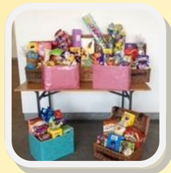
RHS: The SITA Easter Egg raffle

In the run up to Easter Christopher's Smile volunteers packed customer bags in Sainsbury's Camberley and Waitrose in Frimley . We had extra "manpower" at Waitrose from four volunteer ladies from Waterfords Estate Agents . Thanks to the help we received from everyone who gave their time, the bag packing days raised almost £1700.